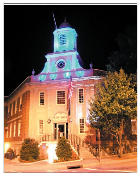
Peekskill's City Hall has a new lighting system as a part of the Revitalization Plan.

Redevelopment of the riverfront and the downtown core. Peekskill has an abundance of vacant, incredibly scenic property, which is exceptionally rare