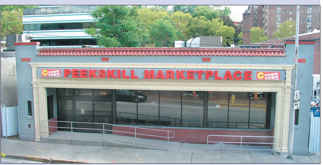
Peekskill Marketplace, the first full-size, full-service grocery store to open in the core downtown in years, was drawn here by the Revitalization Plan and the chance that many new customers might soon be calling Peekskill's downtown home.