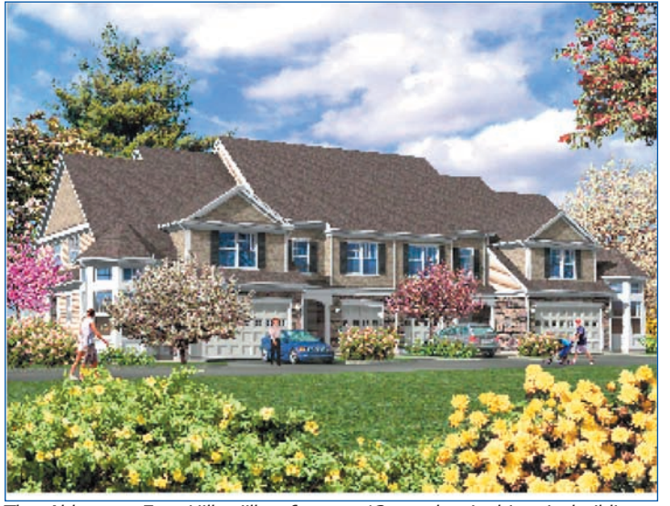
The Abbey at Fort Hill wiill feature 12 condos in historic buildings, 124 new townhomes and beautiful views., with minimal scenic impact.

"This development is consistent with GDC's philosophy and commitment to preserve the convent's beautiful old buildings and integrate new homes while preserving the unique beauty of the site," said Martin